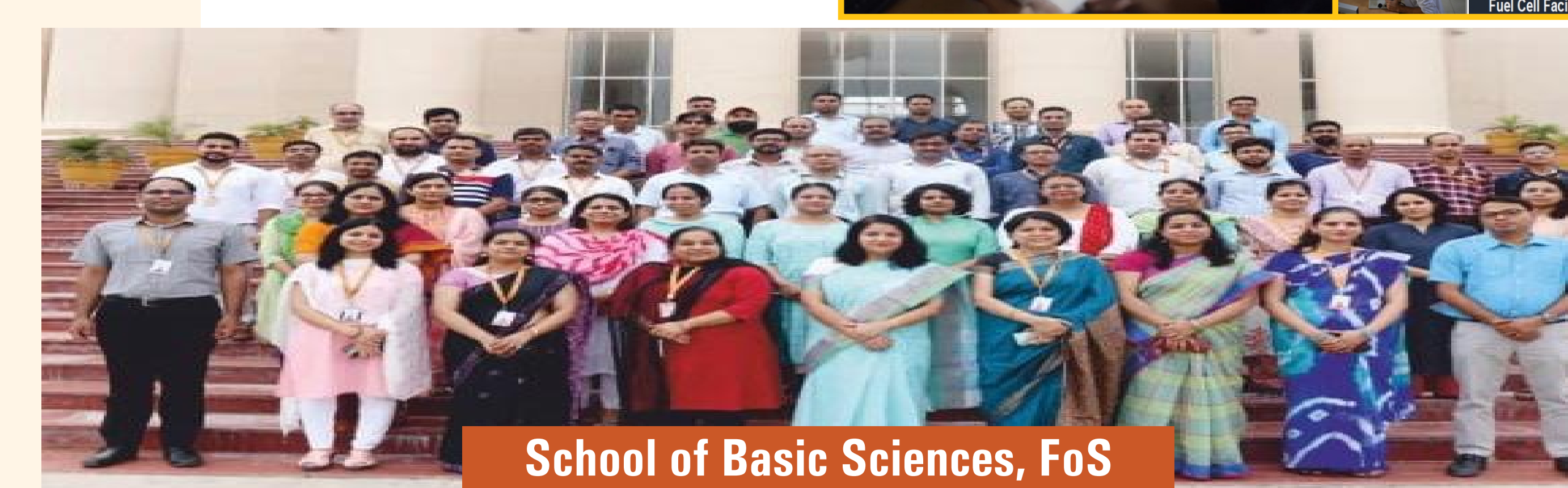
School of Basic Sciences, FoS