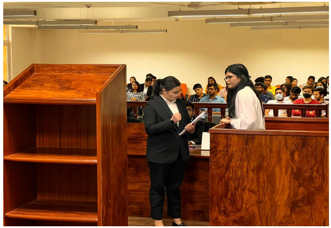
Photographs of event